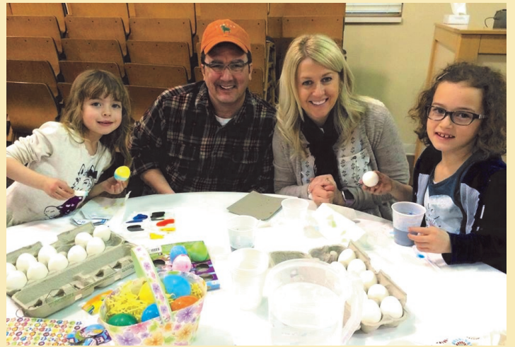
Above: Families enjoying the Easter Egg decorating event at the Family Center Below: Everybody had fun at the annual Iron Kids event held at the Academy Downtown